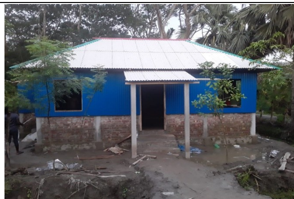
DM Preparedness information center setup completed in Panchakaran union of Bagerhat District.