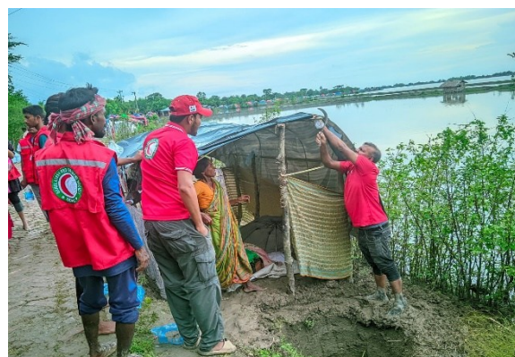
Flood response at Deluti union under Khulna district