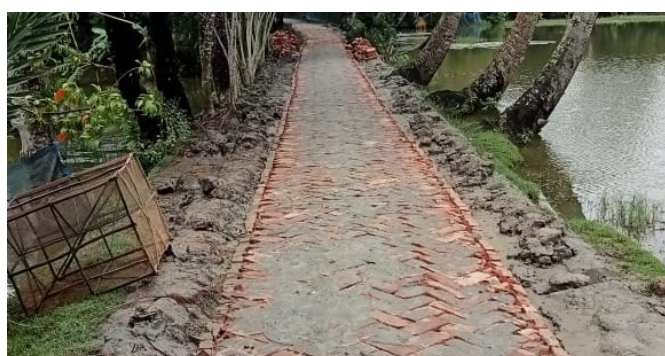
SSM activities is being implemented in Khulna district.