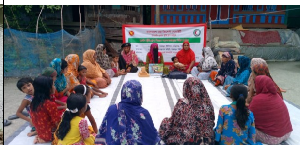
Bi-weekly Conduct Courtyard Session is being conducted at Panchakaran Union in Morrelgonj upazila under the Bagerhat District.