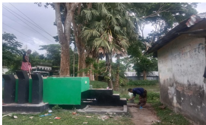
PSF repair work at Sarankhola under Bagerhat