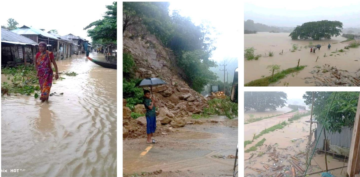
Photos: The image illustrates the flood situation in Rangamati. Floodwaters have submerged large areas, impacting communities and infrastructure. Relief efforts are ongoing, with visible signs of emergency response activities and support for affected individuals.