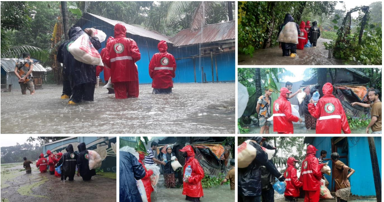
Photos: BDRCS volunteers are actively distributing dry foods in Feni and Noakhali.