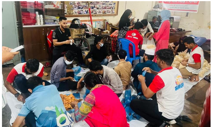
Red Crescent volunteers in Feni branch packing dry food for distribution.

Severe flooding has affected Fulgazi, Parshuram, Chhagalnaiya, Daganbhuiyan and Feni sadar— leaving over 100 villages submerged and more than 100,000 people stranded. The floods have submerged roads, ponds, and cropland, with water reaching the roofs and tin sheds of houses in some areas. Residents have been forced to seek refuge elsewhere. Local authorities and volunteer organizations are distributing relief aid to affected communities. Meanwhile, the Army and Navy, Border Guard Bangladesh (BGB), and coast guards have been deployed in Feni for rescue operations in Parshuram and Fulgazi upazillas (sub-districts). According to the Feni District Commissioner, 1,600 people have taken shelter in 78 designated shelter centres. The rescue efforts involve speed boats and helicopters, as reported by the Inter-Services Public Relations (ISPR).