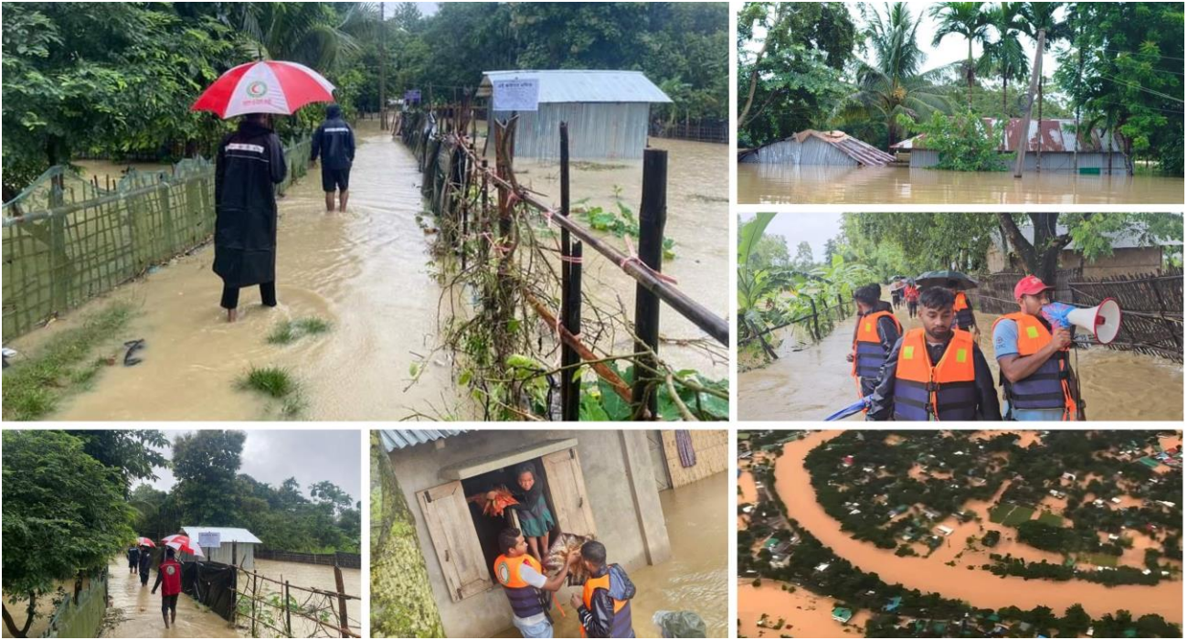
Photos: The image depicts the flood situation in Khagrachari's Dighinala and Naikhongchari in Bandarban. BDRCS volunteers are actively engaged in evacuation efforts and disseminating early warning messages to assist affected communities.