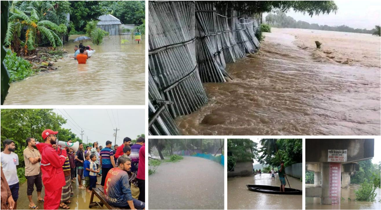
Photos: The image captures the flood situation in Cumilla, showcasing the extent of the inundation affecting various areas.