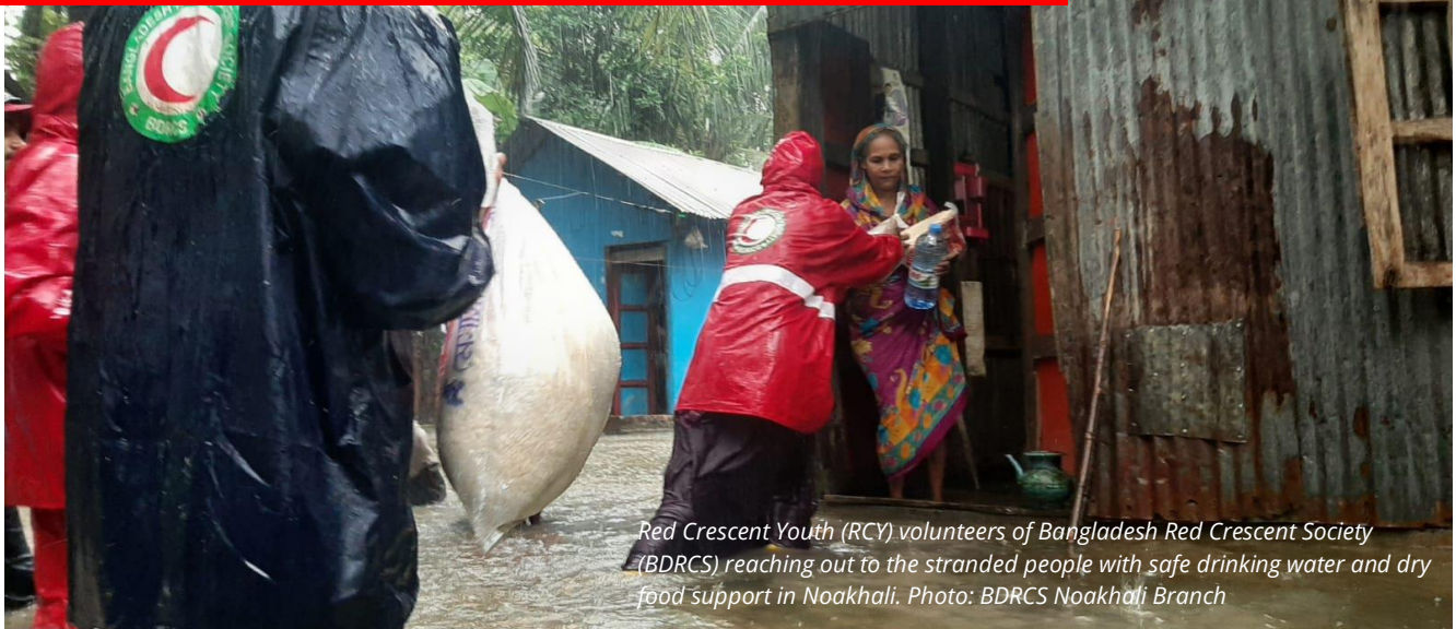
Red Crescent Youth (RCY) volunteers of Bangladesh Red Crescent Society (BDRCS) reaching out to the stranded people with safe drinking water and dry food support in Noakhali.