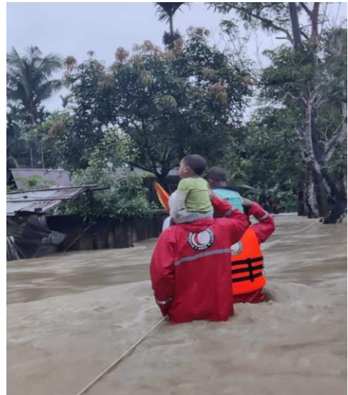
Red Crescent volunteers helping a family to evacuate in Khagrachari district.

In Khagrachari, several upazillas—including Khagrachari Sadar, Dighinala, Mohalchari, Manikchari, Panchari, Guimara, and Ramghare—are experiencing severe flooding due to heavy rains, landslides, and rising water levels in the Khagrachari Maini and Kachalong rivers. Approximately 82 villages and 7000 households have been affected. The flooding has also submerged parts of the Khagrachari-Sajek road, stranding around 250 tourists in Sajek. The situation has led to landslides in multiple upazillas, including Khagrachari Sadar and Dighinala, affecting 30 villages and trapping about 4,500 families. Currently, around 2,000 families have sought refuge in relief centers. The Khagrachari Red Crescent Unit is actively engaged in rescue and evacuation efforts. Immediate assistance is needed in the form of hygiene kits, food packages, shelter kits, and cash support. More than 300 families in the district's flood-hit areas have taken refuge in shelter centres. A total of 99 shelter centres have been opened by the local government throughout the district, where dry/cooked food is being provided to those taking shelter.