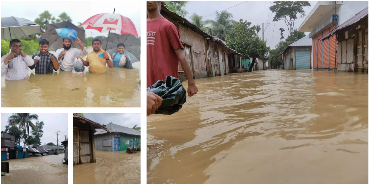
Picture: Flood Situation in Feni