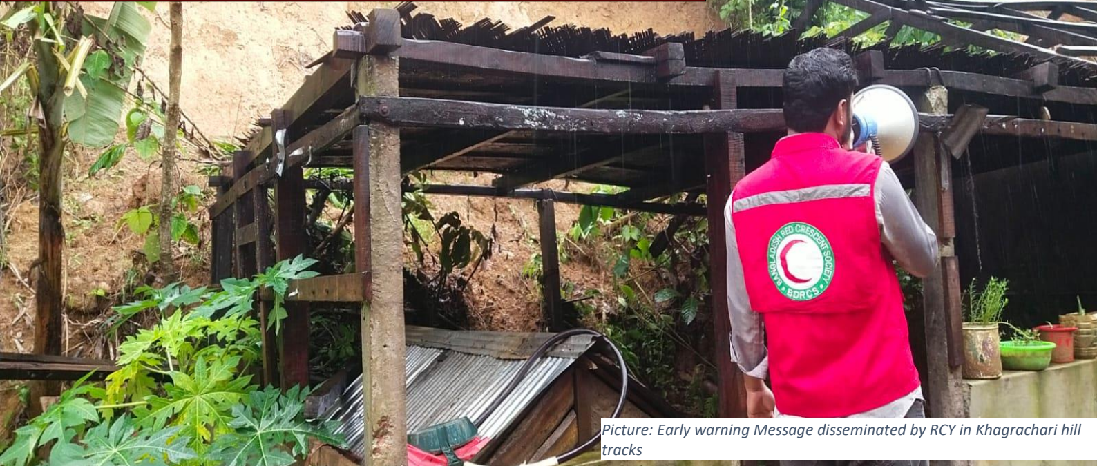
Picture: Early warning Message disseminated by RCY in Khagrachari hill tracks