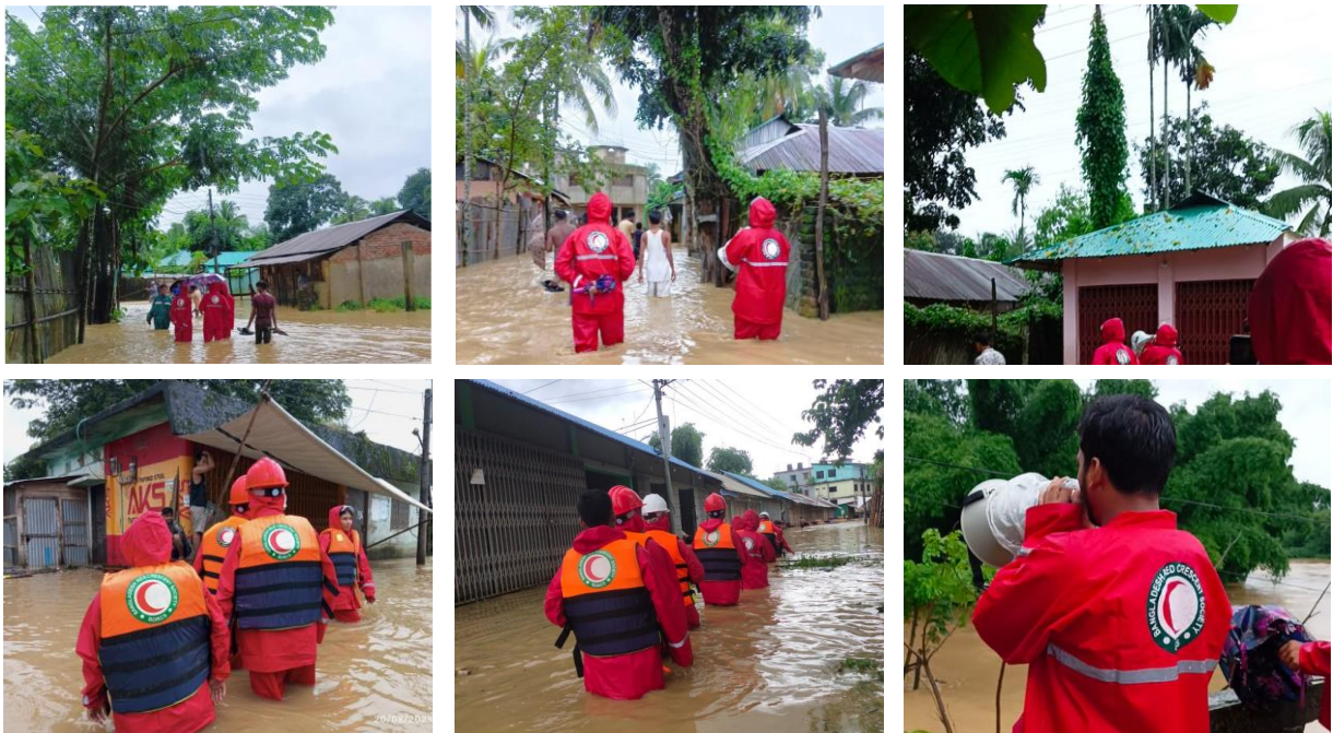
Picture: BDRCS RCY volunteers are actively on the ground, disseminating early warning messages and assisting with evacuation efforts in Khagrachari