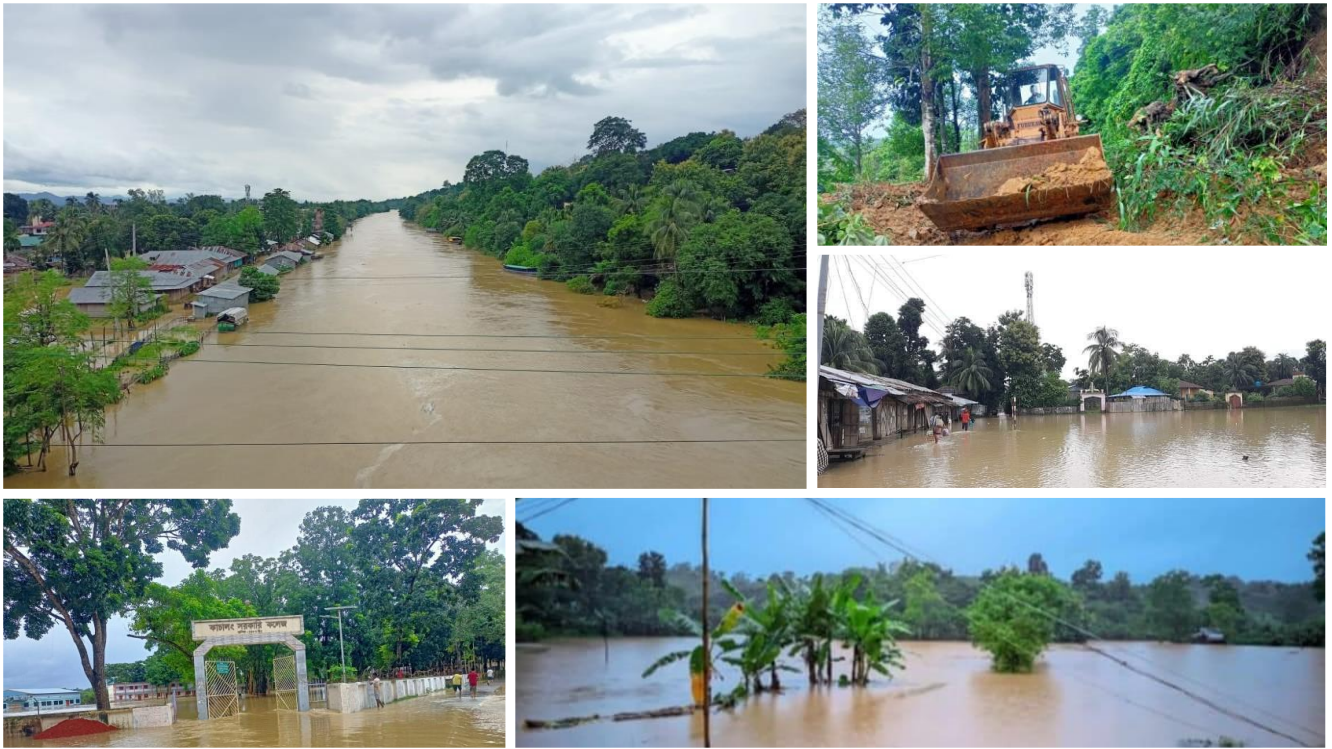
Picture: Flood situation In Rangamati