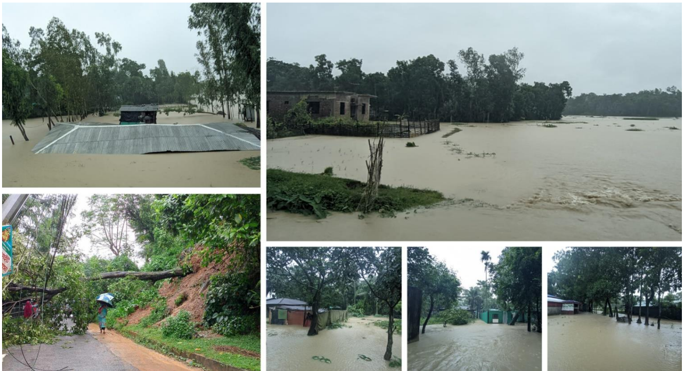
Picture: Flood situation in Pekua Cox's bazar