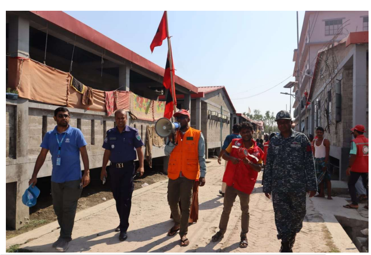
Evacuation drill-Cyclone signal/Warning dissemination by a volunteer