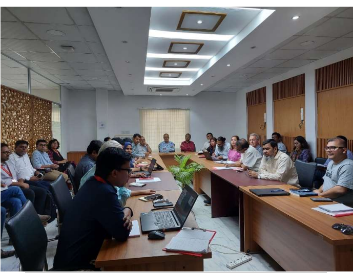
Coordination Meeting with the partners at BDRCS NHQ

Char) and standby Human resources (Volunteers and Staff) have been shared with the meeting participants by the Director, Disaster Response of BDRCS.