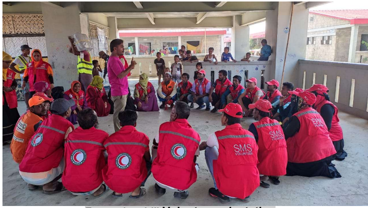
Evacuation drill-Volunteer orientation