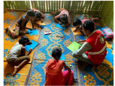
PSS: Children drawing at PSS center in camp 13.

A total of 3,686 (1,991 male and 1,695 female) people through different psychosocial activities (center based structural and Health facility based) PSS at camp 12, 13, 14, 17, 19 and 20 Ext. PSS activities are to listen to the community people empathically, feel them calm and safe. PSS has been ensuring need-based information to build community efficacy and overcome daily stress. Conducting awareness sessions and different stress management activities, PSS team has been assisting the community people to explore conscious or subconscious habits, emotions, and behaviors that could be harmful.