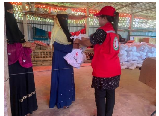
NFI & WASH: Hygiene top up kits' distribution.