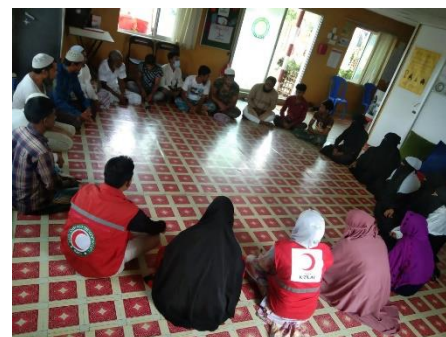
CEA: Community awareness session on COVID-19 in camp 17.