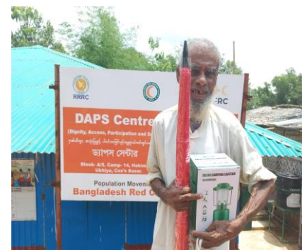
PGI: Umbrella distribution in camp 14.

Workshop was designed with the objectives to develop the knowledge, skills, and awareness of newly recruited and existing staff to comply with the BDRCS' standard Financial and Logistics Management procedures including standard operating procedures (SoP) for budgeting and planning, cash forecasting, procurement, working advance and settlements, and financial reporting. In addition, a special focus was given to Bangladesh tax ordinance, Risk management and prevention of fraud and corruption. Workshop sessions were delivered with case studies, group discussions and presenting outcome of the group exercises. Workshop will minimize the gaps of non-compliance and prevent potential fraud and corruption through the increased awareness and knowledge of staff and bring synergies among the program and support services.