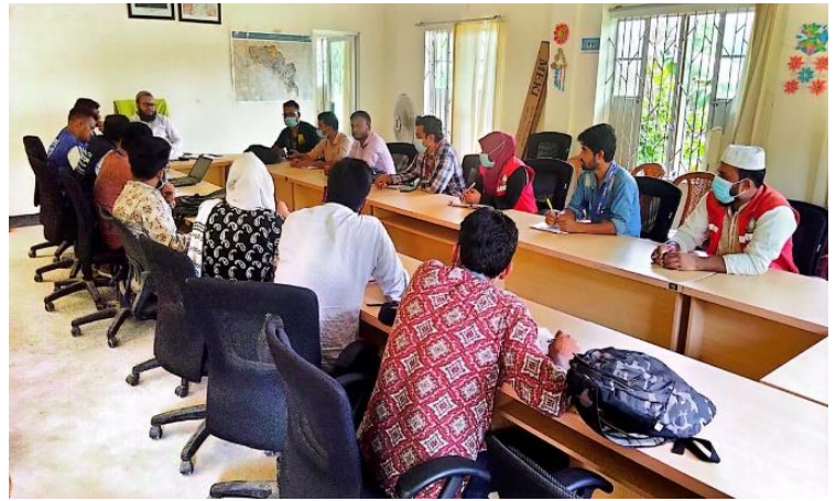
Health: Monthly Health Coordination Meeting with other partners in Camp in Charge (CiC) Office. camp 19.