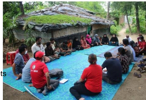
V2R: FCDO representatives are meeting with the CDMC members.