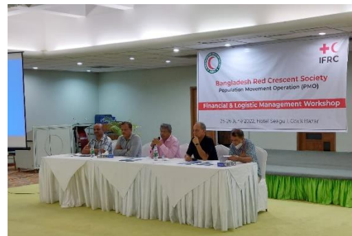
Finance: Workshop on financial and logistics management.