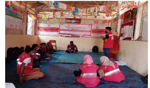
CBHFA: Training on PSEA for CBHFA volunteers in camp 5.

A total of 35,959 people (21,095 male and 15,553 female) has been reached in the reporting month. 9 Team comprised of 161 community volunteers have been working on CBHFA in camps 5, 6, 7, 8E, 12, 14, 17, 19 and 20 Ext, Red Cross & Red Crescent in Action (RCRC), Basic First Aid (FA), Epidemic Control for Volunteers (ECV), Psychosocial Support (PSS), Nutrition, Family Planning and Non-communicable Disease (NCD) and Nutrition status measuring (MUAC) with strengthening referral pathway visiting door to door.