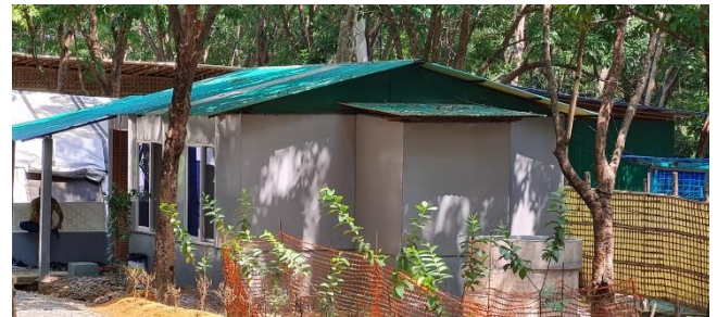
Shelter: Mosque reconstruction in Field Hospital, camp 07.