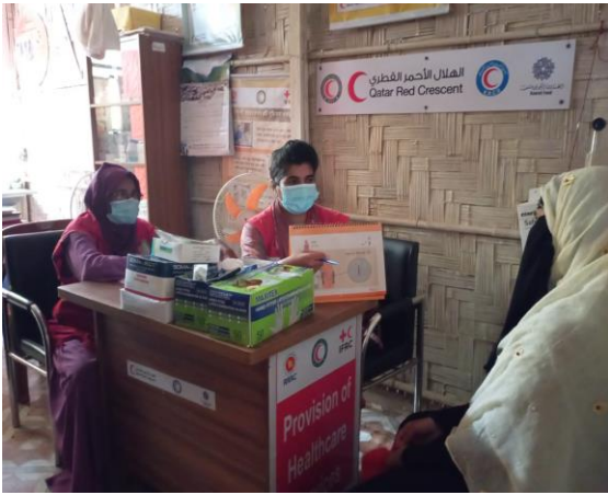
Health: Counseling on Family Planning at Health Post in camp 19.