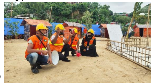
CPP: A drill on cyclone EW-ER in camp 7.