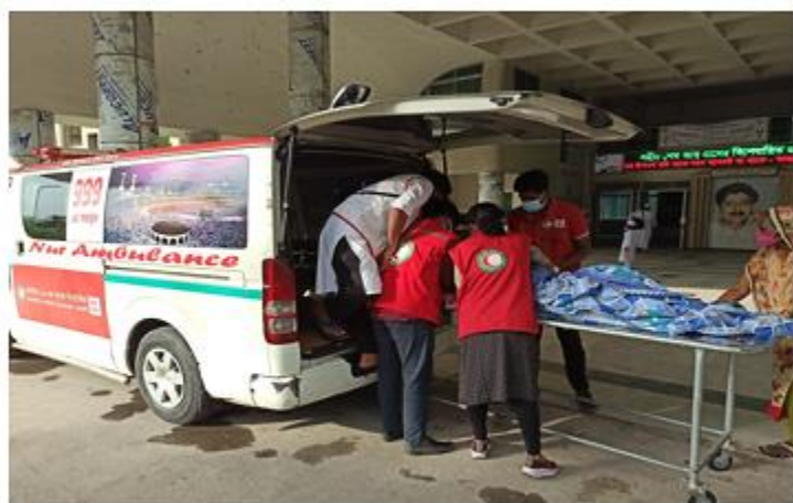
Ambulance support at BDRCS Khulna city and district unit

COVID-19 response initiatives of ambulance service and cooked food distribution at respective units. 3 RCY volunteers supporting ambulance service at every unit on an 8-hour shift duty for each day while 10 RCY volunteers supporting cooked food distribution every day in all concerned units every day.