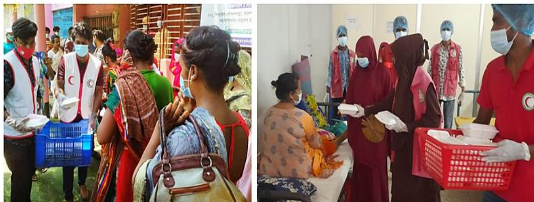
Food Distribution among COVID-19 patients at hospital and transgender individuals.

⇒ During the reporting period, 91 RCY volunteers extensively supporting the